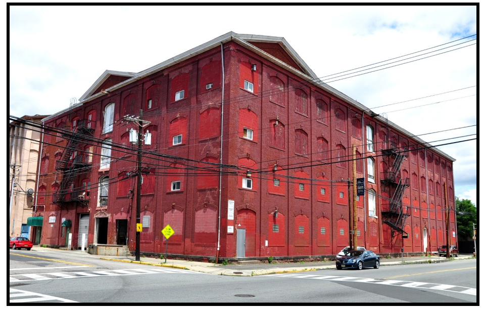
BARNERT 2: present day view, compare with Barnert 1, looking NE from corner of Grand (right) and Dale (left) showing S and W sides.