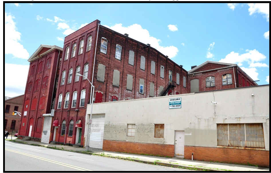
BARNERT 8: oblique overview looking NW, showing 1-story, non-contributing addition along Railroad Ave. While these are two continuous buildings that are in use on the property, they are not historic and non contributing to the site's integrity or significance.