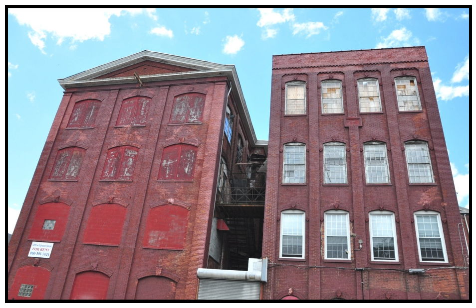
BARNERT 6: detail view looking W from Railroad Ave., showing E facades of the two independent structures with a distinctive stylistic approach to each façade.