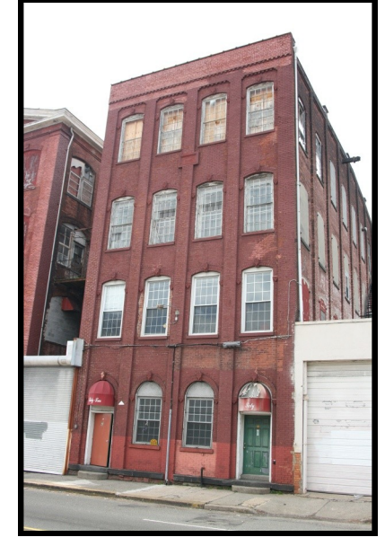
BARNERT 7: oblique detail views looking SW of each of the Railroad Ave facades.