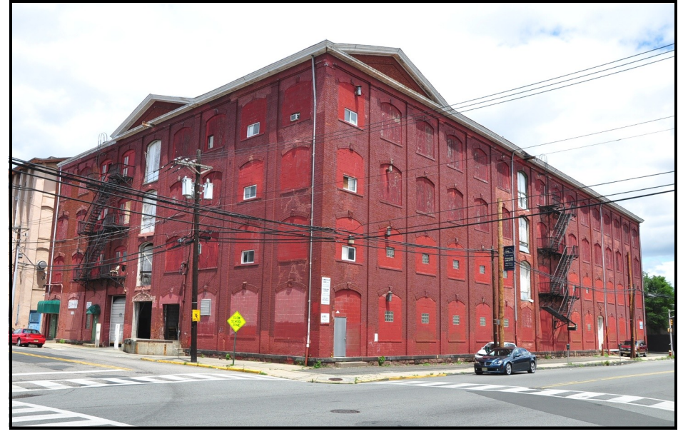
BARNERT 5: oblique overview, looking NE from corner of Grand (right) and Dale (left) showing S and W sides.