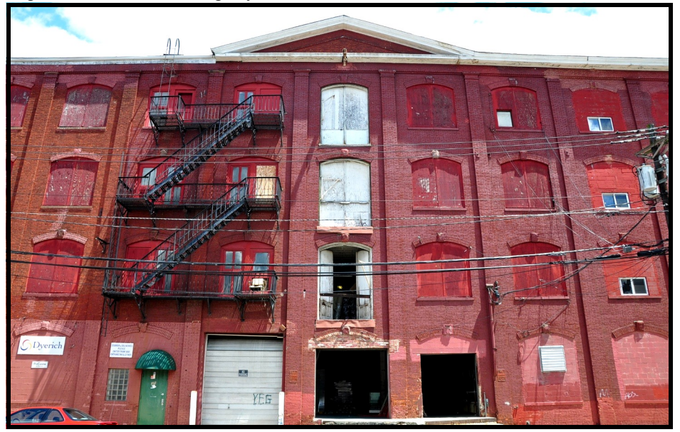
BARNERT 3: detail view of W side, looking E from Dale Ave. Note central hoisting bay over four converted entrances.