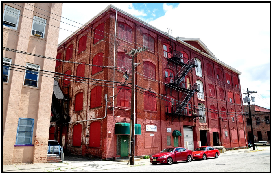
BARNERT 4: oblique overview of N and W sides, looking SE from Dale Ave. Note additions of loading docks and converted entrances at center of W side.