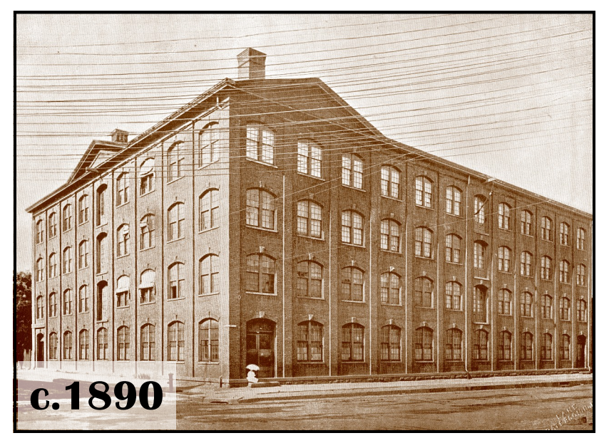
BARNERT 1: c.1890 looking NE from corner of Grand (right) and Dale (left) showing S and W sides. Hoisting bays are located at the center of each side.